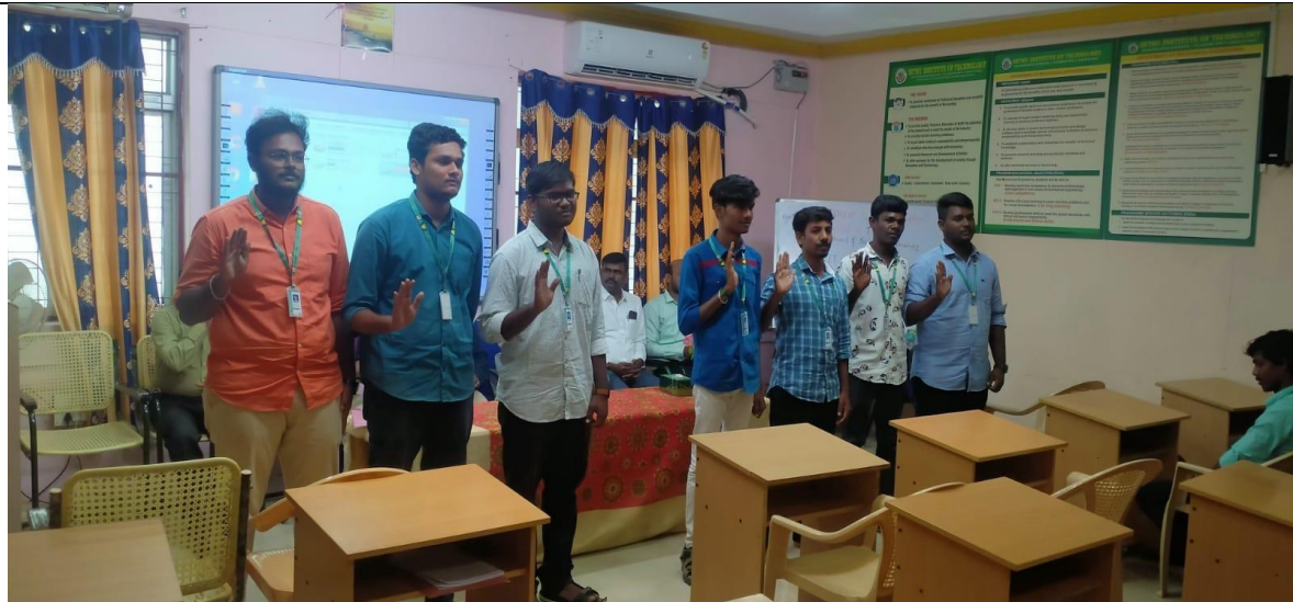
The Indian Society of Heating, Refrigerating and AirConditioning Engineers (ISHRAE) Student committee members taken pledge on 29.09.2022