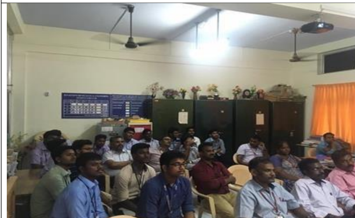
Student representation in Departmental advisory Board meeting on 01.09.2020