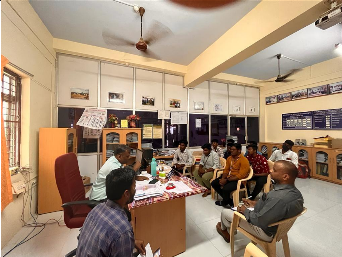
Student representation in Class Committee meeting on 18.01.2023