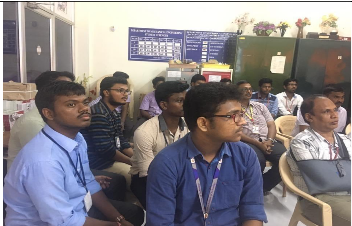
Student representation in Program Assessment Committee through off line mode on 15.02.2021