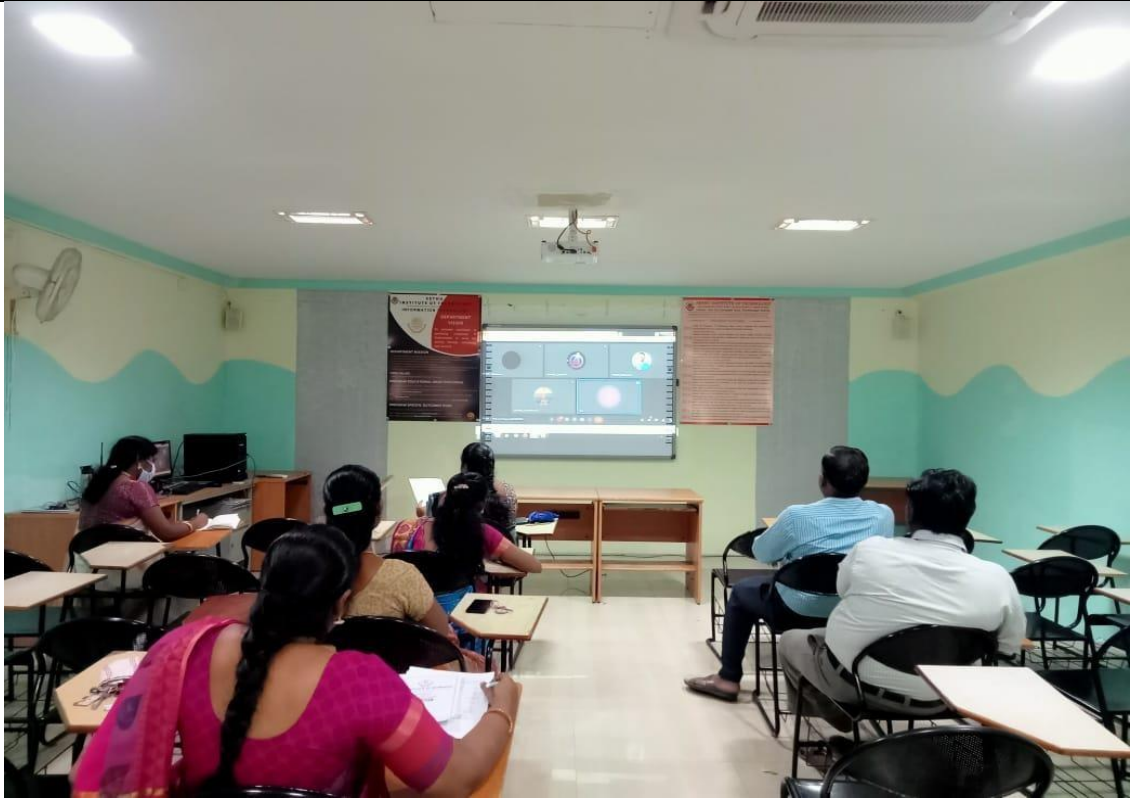
Student representation in Program Assessment Committee through on line mode on 15.05.2020